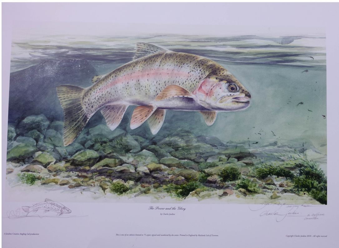
L05 Charles Jardine Framed Print: “THE POWER AND THE GLORY”

YOUR BID Supports SPFF's CONSERVATION & EDUCATION Projects