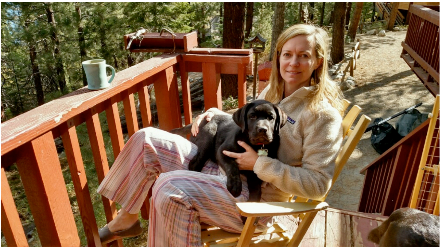
L12 You, too, can enjoy your coffee on the deck of a comfortable June Lake Cabin. Labrador not included.

YOUR BID Supports SPFF's CONSERVATION & EDUCATION Projects