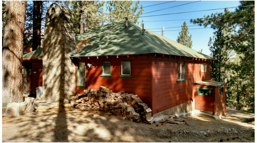
L12 The Radanovich Family's June Lake Cabin.