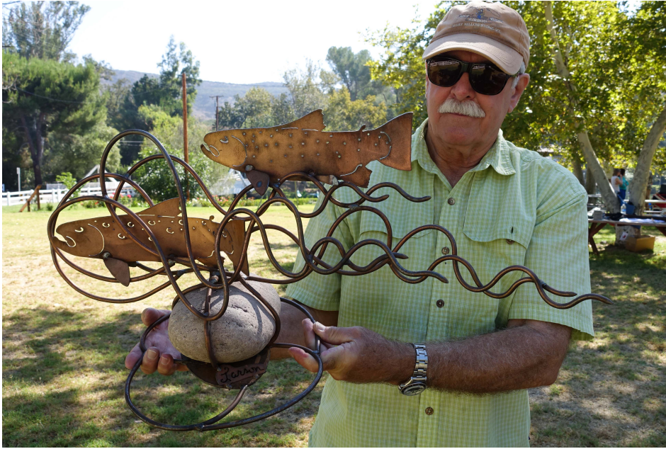
L 01 Metal Fish Sculpture