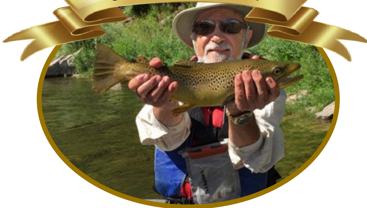
Rich Ress Brown Trout, Green River