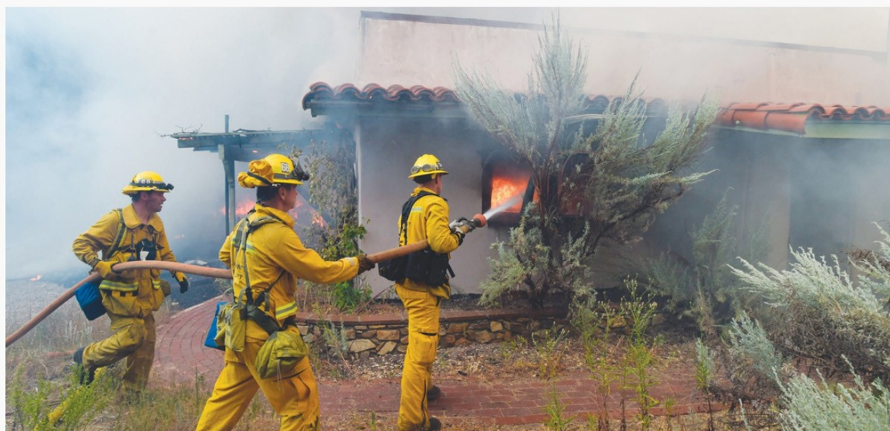
OLD FIRE—Firefighters battle a blaze at the Bartelle House in Calabasas last year. Mountains Restoration Trust, which uses the property at Headwaters Corner for educational purposes, will construct a new interpretive center in cooperation with the City of Calabasas, which has applied for a grant.

By TO Acorn Staff | on November 16, 2017