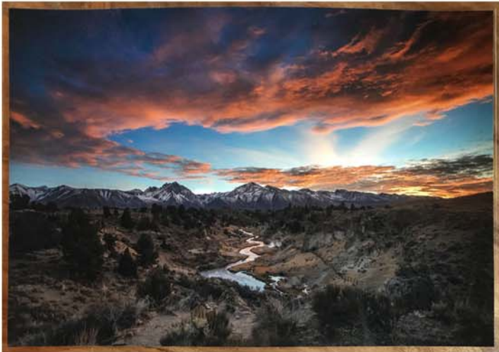
M14 - Hot Creek Photo