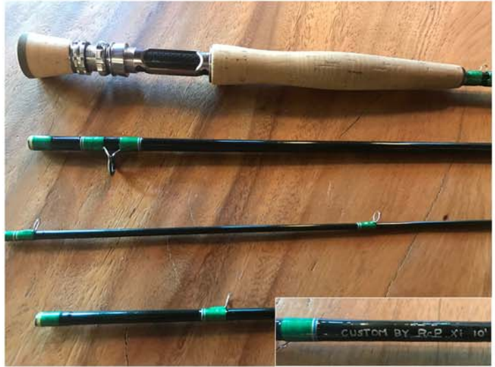
L11 - Custom Made Rod