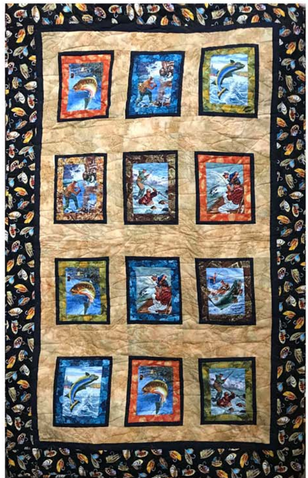
L04 - Fly Theme Quilt